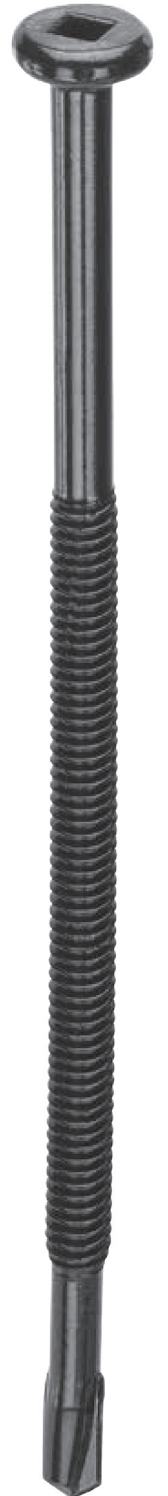
Enlarged to show detail