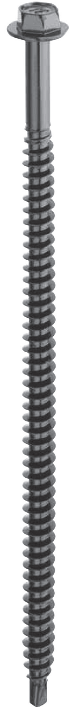
Enlarged to show detail

* All values shown are nominal. Thread length measured from tip of the drill point to end of the threads