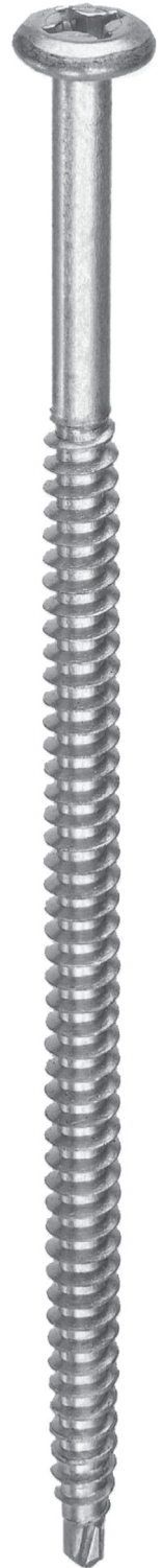
Enlarged to show detail

* All values shown are nominal. Thread length measured from tip of the drill point to end of the threads