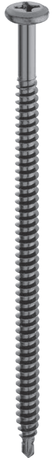
Enlarged to show detail

* All values shown are nominal. Thread length measured from tip of the drill point to end of the threads