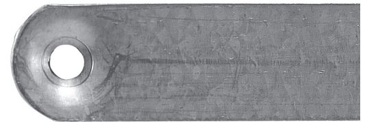
PERLOK RECESSED BATTEN BAR