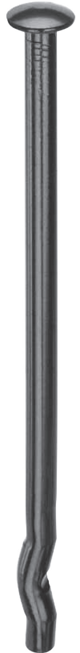
Enlarged to show detail