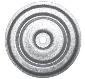
PERLOK 3" Recessed Metal Insulation Plate