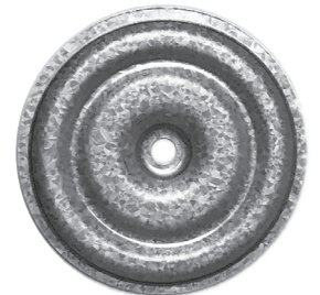
PERLOK 3" Metal Insulation Plate