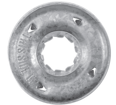
PERLOK 2" TL Seam Plate