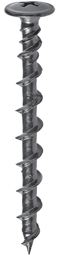
Enlarged to show detail