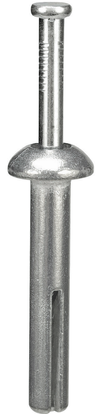
Enlarged to show detail

The strength of different roof decks can vary widely and can be adversely affected by moisture and other conditions. Therefore, it is recommended that a fastener pull test be conducted to help evaluate deck condition and fastener suitability. Contact Performance Roof Systems Technical Services to schedule testing.