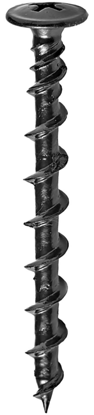
Enlarged to show detail